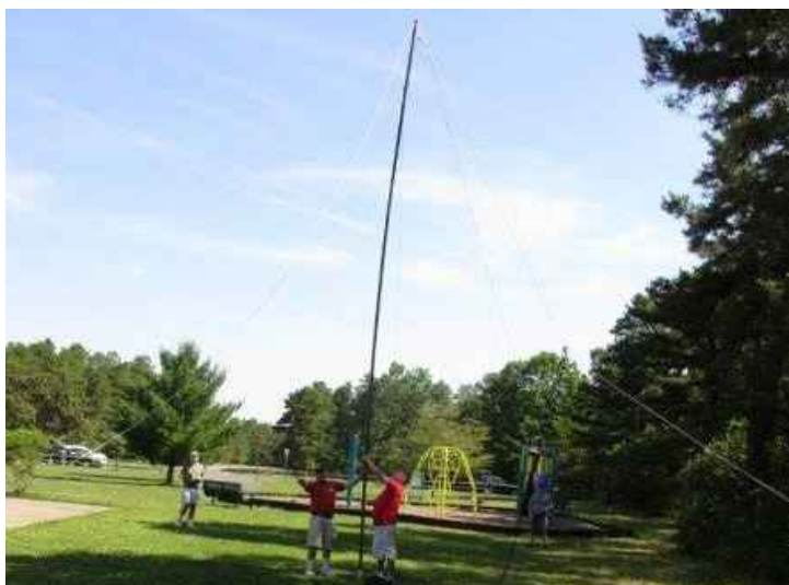
The other end of the first antenna, a 20m full wave