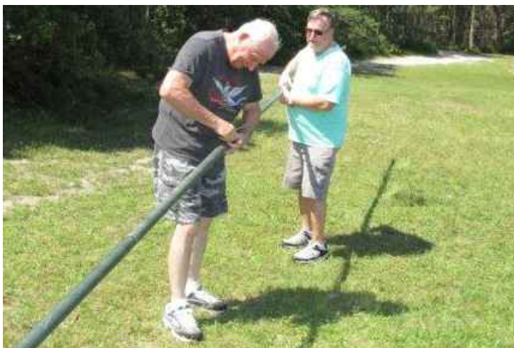
Preparing the third antenna, an 80m end-fed