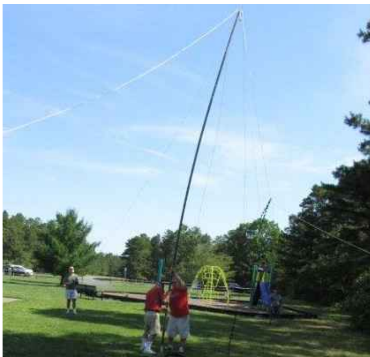
Setting up one end of the first of three antennas